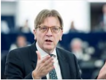
Guy Verhofstadt speaking in the European Parliament

"If EU leaders fail to agree to reform our common European migration and asylum system during the next Council meeting, we have to bring the Council to Court under article 265 of the Treaty for 'failure to act';" urged ALDE Group leader Guy Verhofstadt during the European Parliament plenary debate on Tuesday.